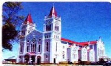
5. c _____

1 Find one odd word A, B, C, or D. Then read them aloud.