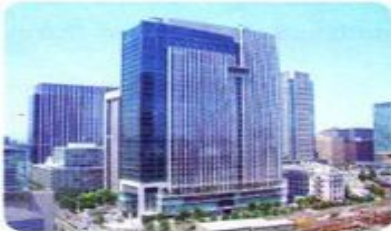
1. b _____

2 Give the names of the following pictures, then read the words aloud (the first letter of each word is given).