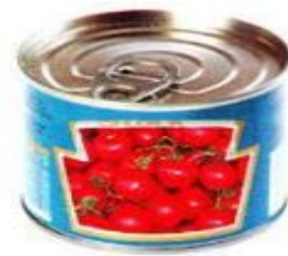
3. t _____