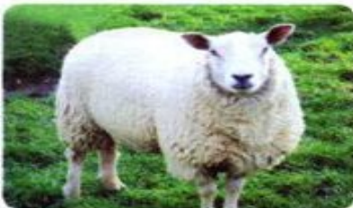
4. s _____