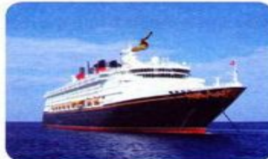
2. s _____